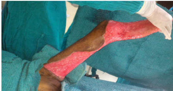
Fig. 5: Post Traumatic Raw Area Over Thigh And Leg