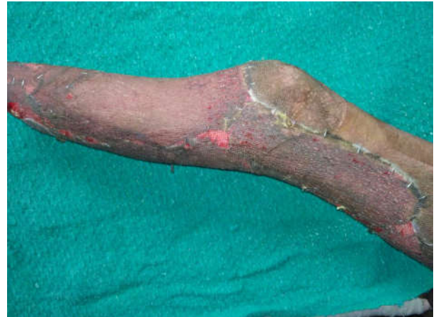
Fig. 8: Post Operative Day 7: Showing Almost 97% Graft Take