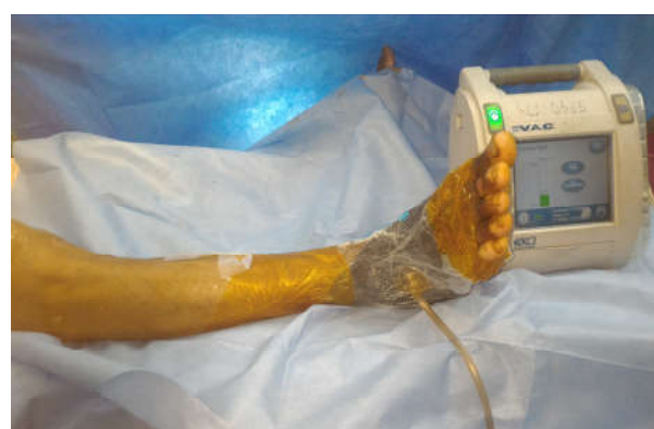
Fig. 3: The Npwt Dressing was Done Over The STSG