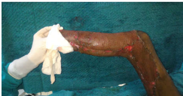
Fig. 7: The Raw Area Resurfaced with Split Thickness Skin Graft