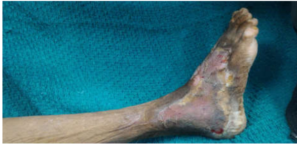
Fig. 4: Post Operative Day 7: Showing Almost 98% Graft Take